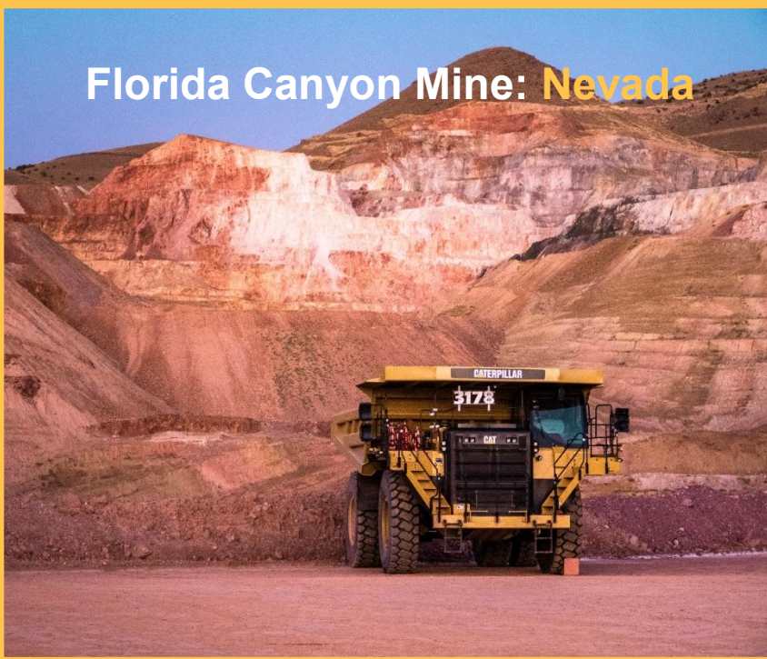
Florida Canyon Mine: Nevada