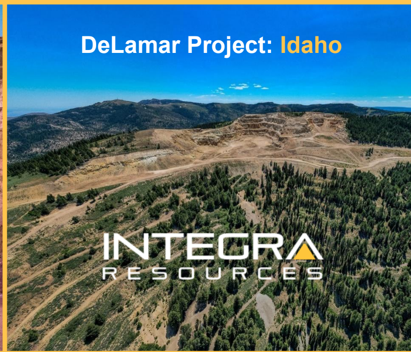
DeLamar Project: Idaho